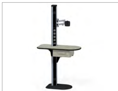
Repair reception column