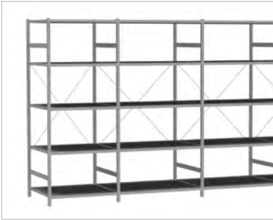
Heavy duty shelves

Tidiness is the basis for efficient work. And we have the right solutions for this. Starting with tall cabinets to (mobile) side cabinets or workbenches with drawer cabinets. We will be happy to advise you on individual storage space solutions for your requirements.