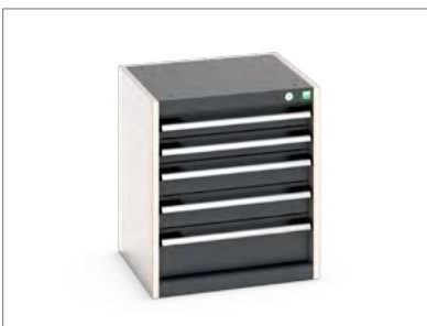
Workshop base cabinets