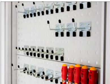
Perforated plate accessories

We at ELABO are experts in the entire field of workplace solutions and will be happy to create a coherent overall concept for you, including accessories. For this purpose, our expert planners will record all important criteria on site and coordinate them with you.